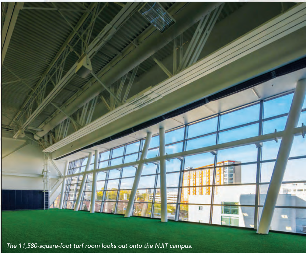
The 11,580-square-foot turf room looks out onto the NJIT campus.

functions. Adjacent to the main concourse is a team store that can be open to sell Highlanders gear throughout the school year. The other major space on the second level is the recreation center, featuring cardio fitness equipment, weight stations and an incredible view across campus.