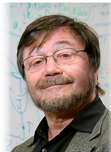
JUDEA PEARL M.S. EE '61