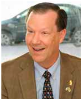
Promoting New Jersey at a meeting in Israel