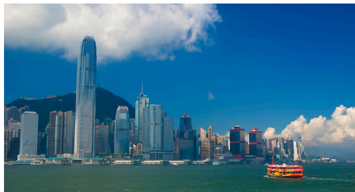
A view of Hong Kong