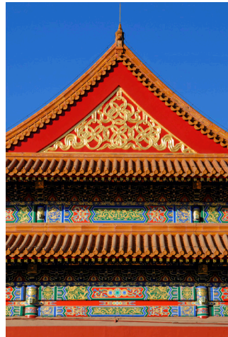
Detail of the Forbidden City in Beijing