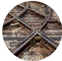
Overly optimistic investment in U.S. railroads in the 19th century left the nation with vital transportation infrastructure.

During the Great Depression, the Banking Act of 1933 established the Federal Deposit Insurance Corporation. It also constrained banks from making risky investments with money that depositors expected would be used for secure mortgage and business loans. Effectively eliminating this firewall between commercial and investment banking by 2000, many experts believe, played a