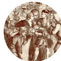
The frenzied speculation of Britain’s 18th-century South Sea Bubble inflated the stock of a company promoting trade with South America.

But are all bubbles harmful to the same degree? Not necessarily, says Rapp, of a concept he and Ehrlich also say is controversial. When some bubbles collapse, even though they create economic distress of varying duration, they