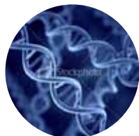
The biotechnology bubble of the early 1990s encouraged careers in biology, medicine and related fields.