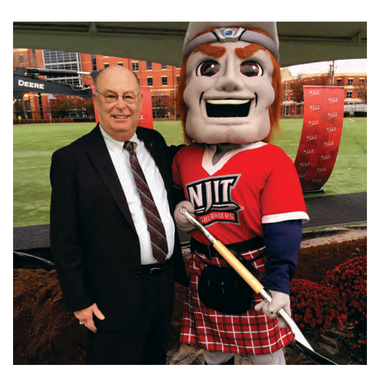
At the groundbreaking ceremony for the new Wellness and Events Center, slated for completion in fall 2017.

The Alumni Association has also hit the ground running in 2016. In January we hosted a meeting of the Alumni Council where over 80 alumni and campus leaders gathered to focus on how the resources of NJIT alumni could be used to drive the activity in the following cohorts: Admissions, Career Development Services, Greeks,