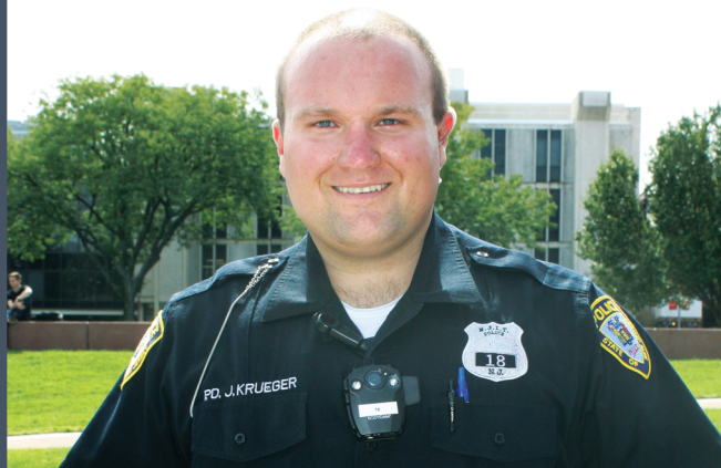
The department recently deployed body-worn cameras to all NJIT police officers. Cameras can be mounted on the shoulder or center chest even with the badge line; plain clothes officers may wear cameras anywhere from their waistline up to their shoulder line.