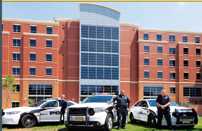
The Public Safety Department's vehicle fleet, shown here in front of the Honors Residential Hall, helps maintain a safe and secure environment for students, faculty, staff and visitors.