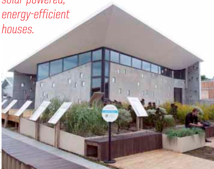
The eJoy House on the National Mall