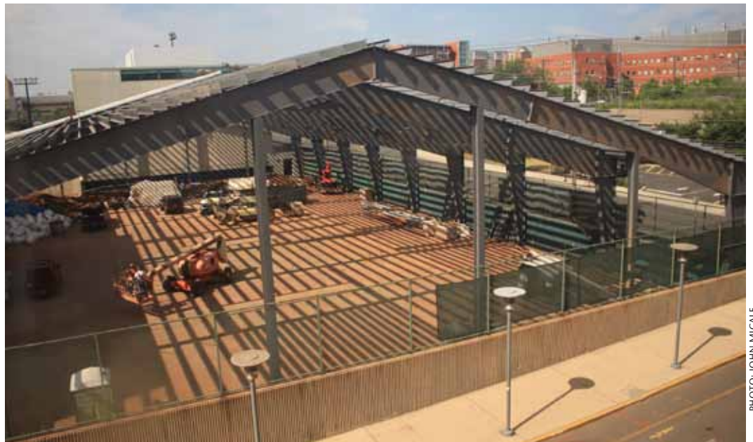
The Naimoli Family Recreation Center under construction