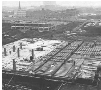
The 1960s were years of great physical change on campus, as well as a time of domestic social reassessment and international challenges.

"We do not live in an easy age. Many predict that the so-called Cold War is a condition with which we may have to live for years to come. The more cynical among us, including some reputable analysts of our society, see already in our Western civilization the seeds of our ultimate decline and fall. I do not see things that way, and I trust that you do not either."