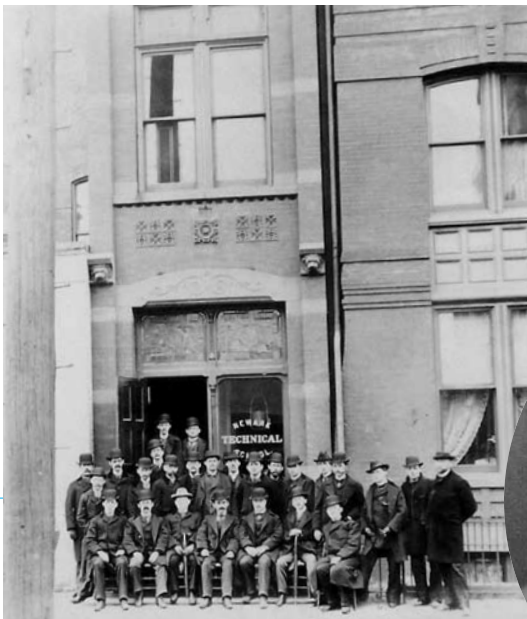
The first students to attend Newark Technical School studied in a rented building on West Park Street.