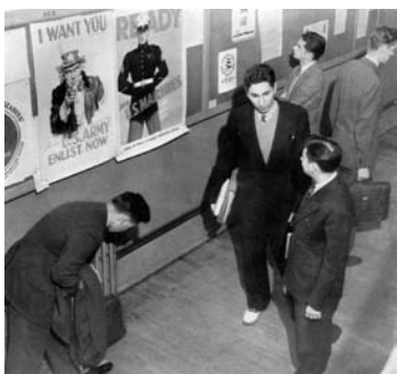
As across the nation, the call to service in the Armed Forces and defense industries was strong at Newark College of Engineering during World War II.

"Let us resolve to develop within ourselves the right spirit that we may accept to the fullest our responsibilities as citizens and conscientiously strive to make this country of ours a better, stronger America – an America which will be recognized by all the world as a vital dynamic force for good."